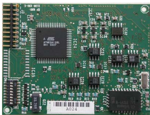
(ELMB128, approximate true size)

Henk Boterenbrood ( boterenbrood@nikhef.nl ) NIKHEF, Amsterdam 25 Nov 2004