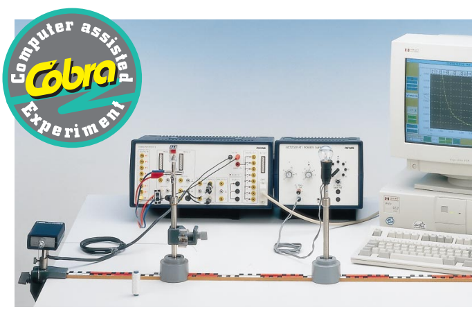
Dependence of illumination intensity on distance (CWR 8)