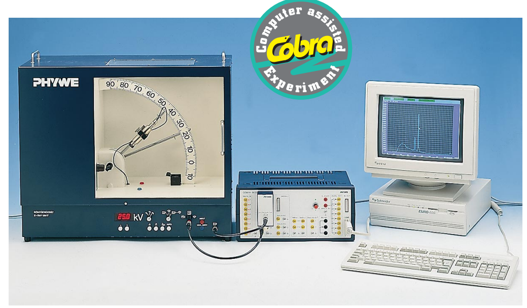
Characteristic radiation of copper in higher order diffraction (CBX 2)