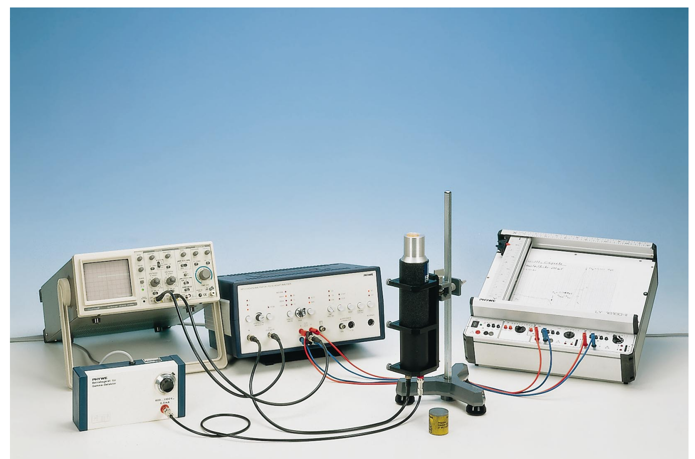
Fig. 1: Experimental set-up: Internal conversion in <sup>137m</sup>Ba.

The layout of the detection apparatus is shown in Fig. 1, a layout in which very few \gamma -quanta occur which have undergone backscattering on contact with the environment. The detailed directions in the operating instructions of the \gamma -detector, the pulse height analyzer, the oscilloscope and the recorder, should be complied with. The detection apparatus must be calibrated before the measurement. The following settings should be selected: