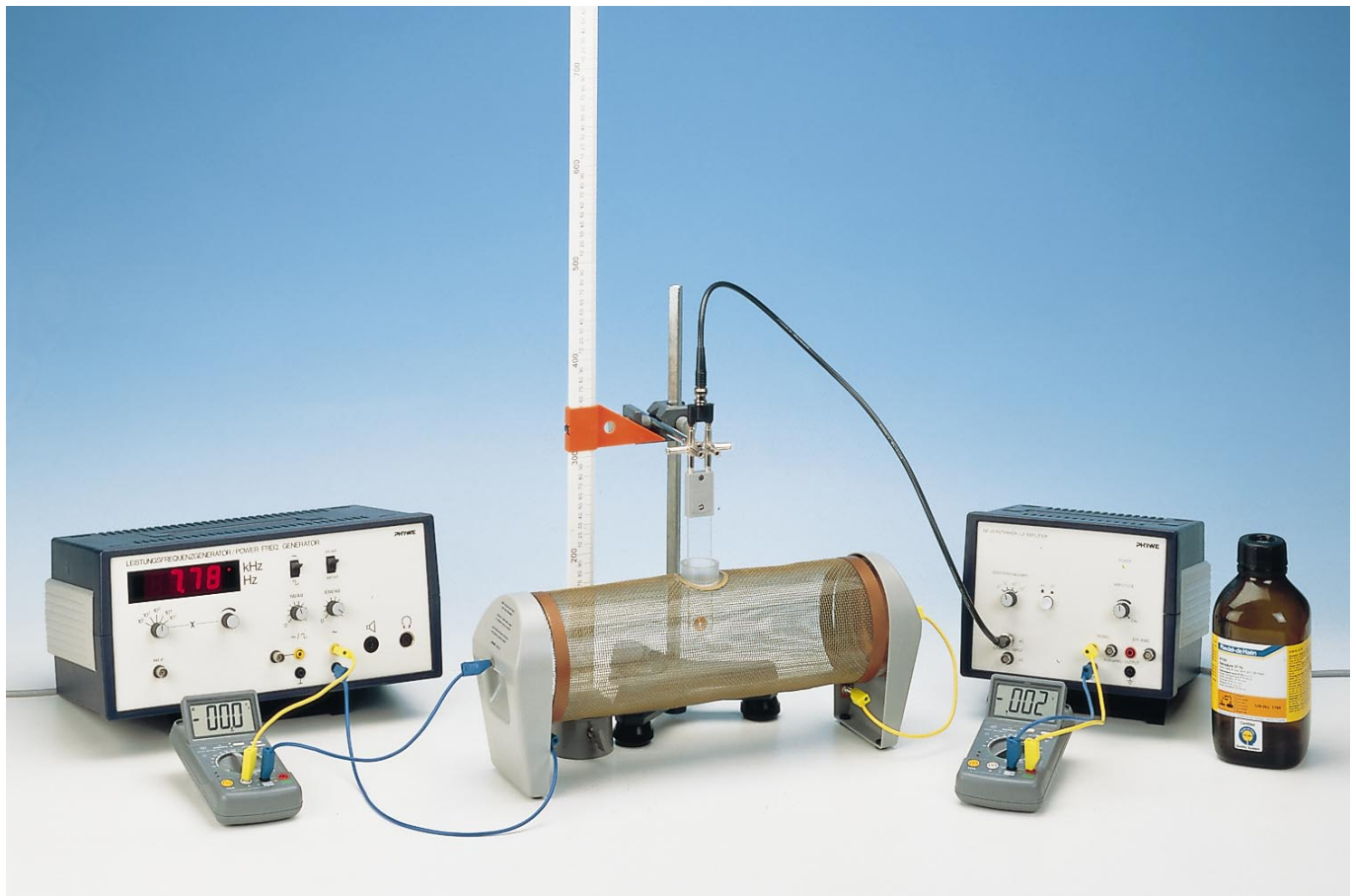
Fig. 1: Experimental set-up for determining the magnetic field inside a conductor.

The experimental set up is as shown in Fig. 1. The electrolyte (approx. 200 ml of 37 % hydrochloric acid to 4 litres of water) is poured into the hollow cylinder after it has been thoroughly mixed. The aperture must not be tightly closed, so that gases released ( H_2 , O_2 ) can escape. The various connection sockets on the hollow cylinder permit separate measurements on the electrolyte and on the jacket (hollow cylinder). Account must be taken of the fact that the magnetic field strengths to be measured lie in the \mu T range, i.e. the cables carrying the current - especially the return lead - also produce a magnetic field which is of the same order of magnitude.