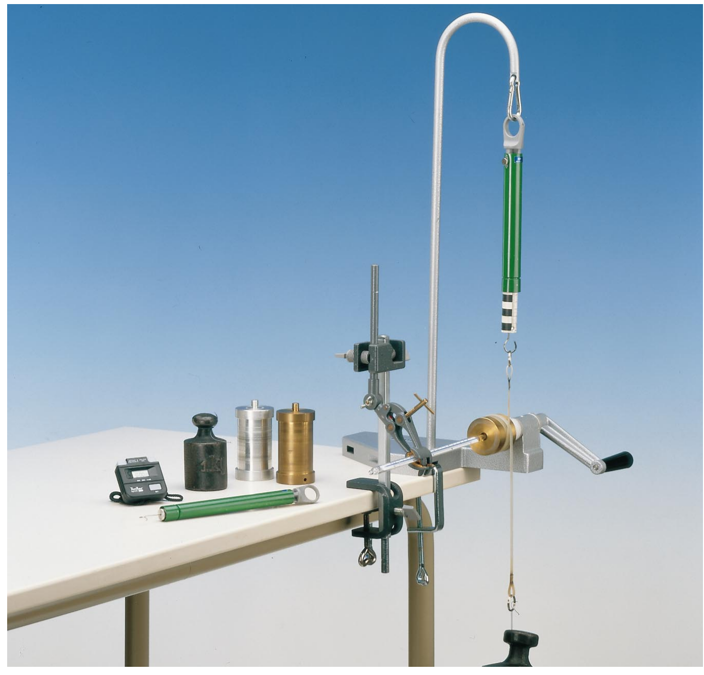
Fig. 1: Experimental set-up: Mechanical equivalent of heat.