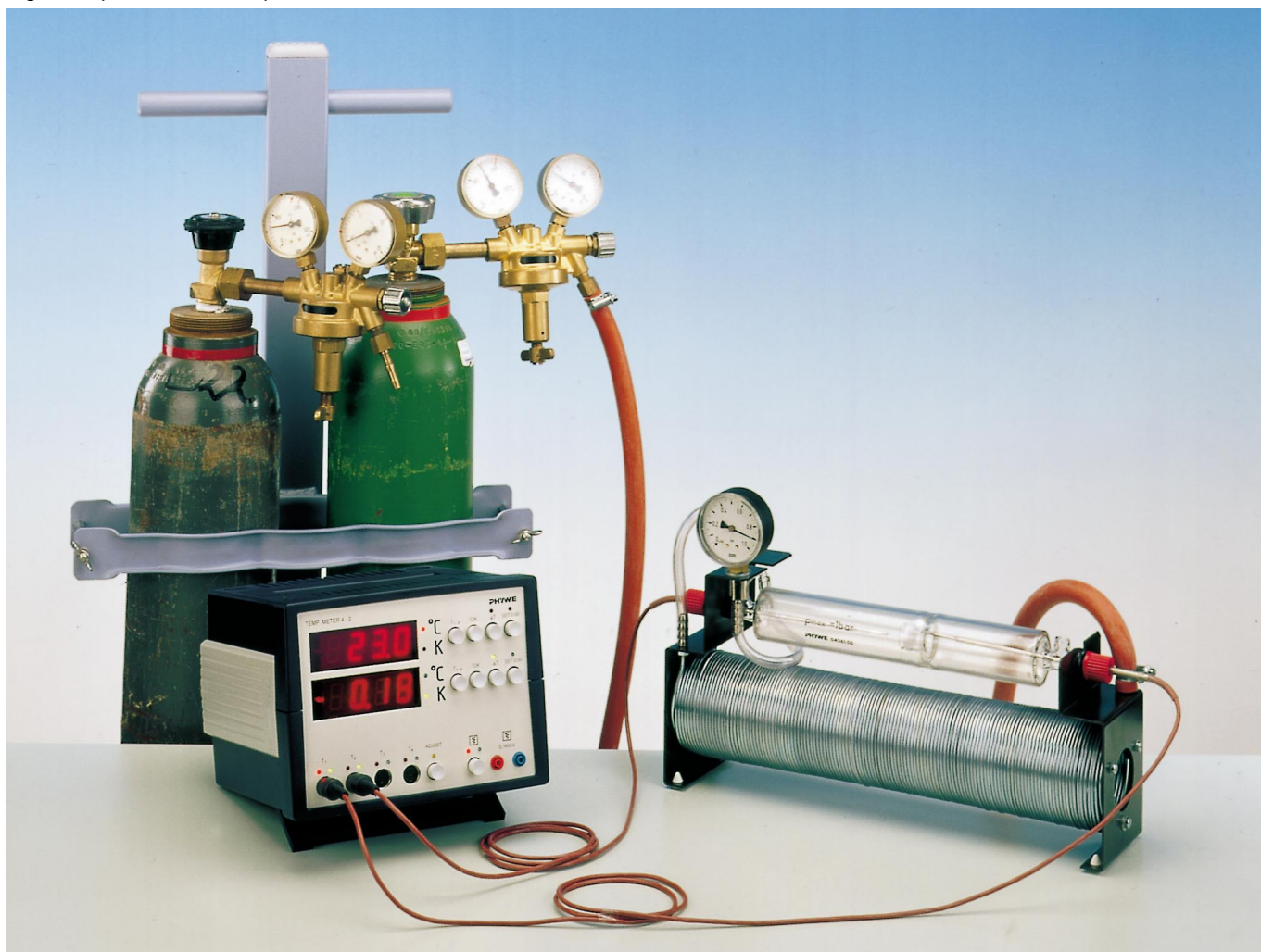
Fig. 1: Experimental set-up: Joule-Thomson effect.

On each side of the glass cylinder, introduce a temperature probe up to a few millimetres from the frit and attach with the union nut. Connect the temperature probe on the pressure side to inlet 1 and the temperature probe on the unpressurised side to inlet 2 of the temperature measurement apparatus.