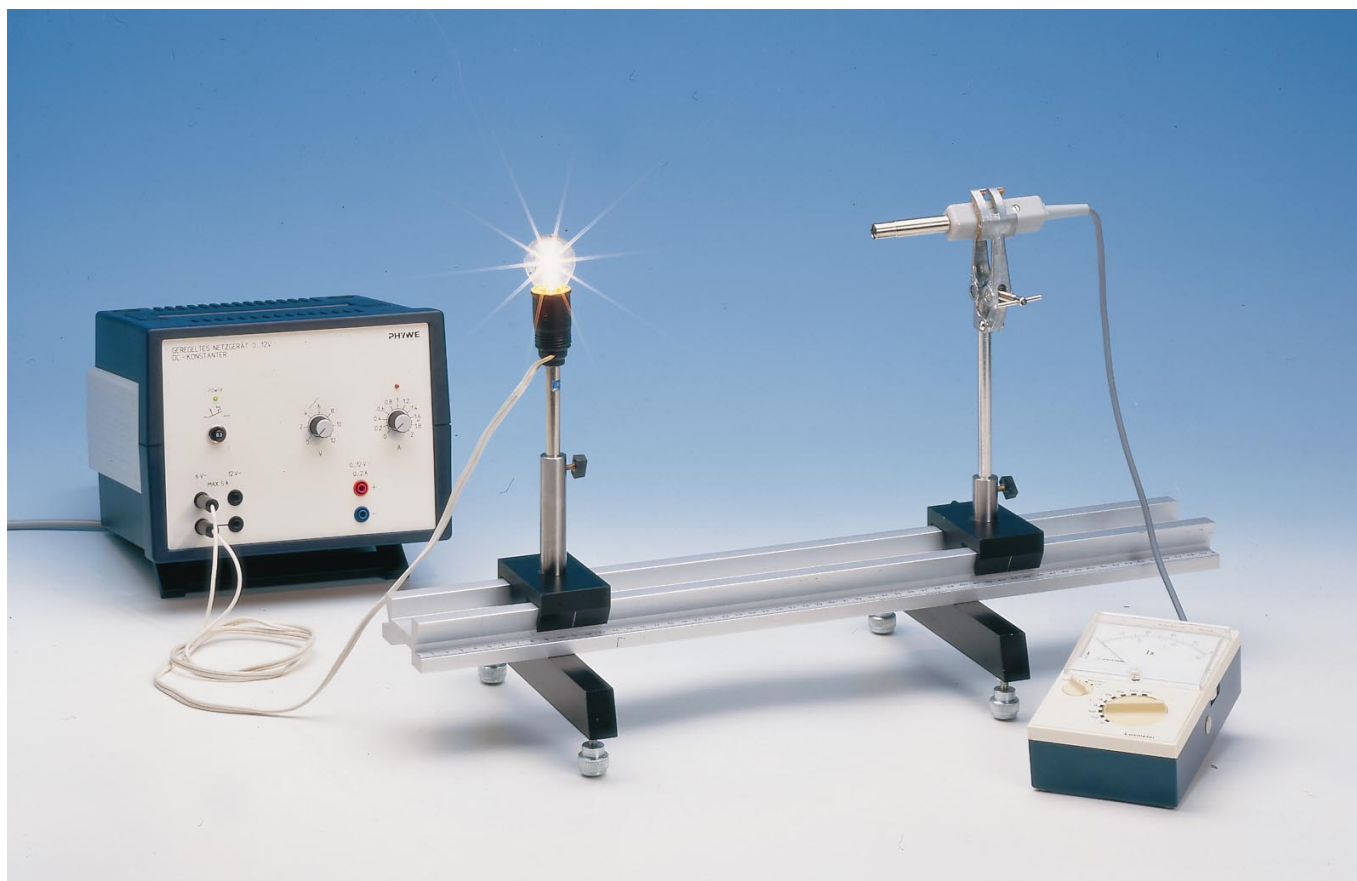
Fig. 1: Experimental set-up: Photometric law of distance.