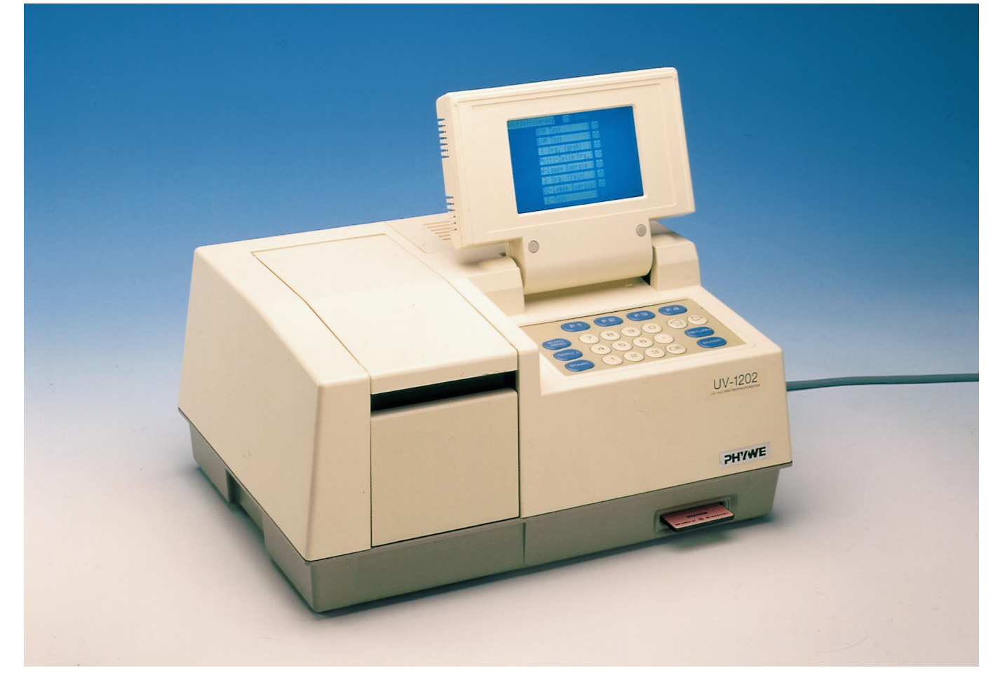
Fig. 1: Experimental set-up: Transmission of colour filters – absorption of light (UV-VIS spectroscopy).

0.001 molar methyl orange solution: Weigh 33 mg of methyl orange into a 100 ml volumetric flask, dissolve it in distilled water, and fill the volumetric flask with distilled water to the calibration mark.