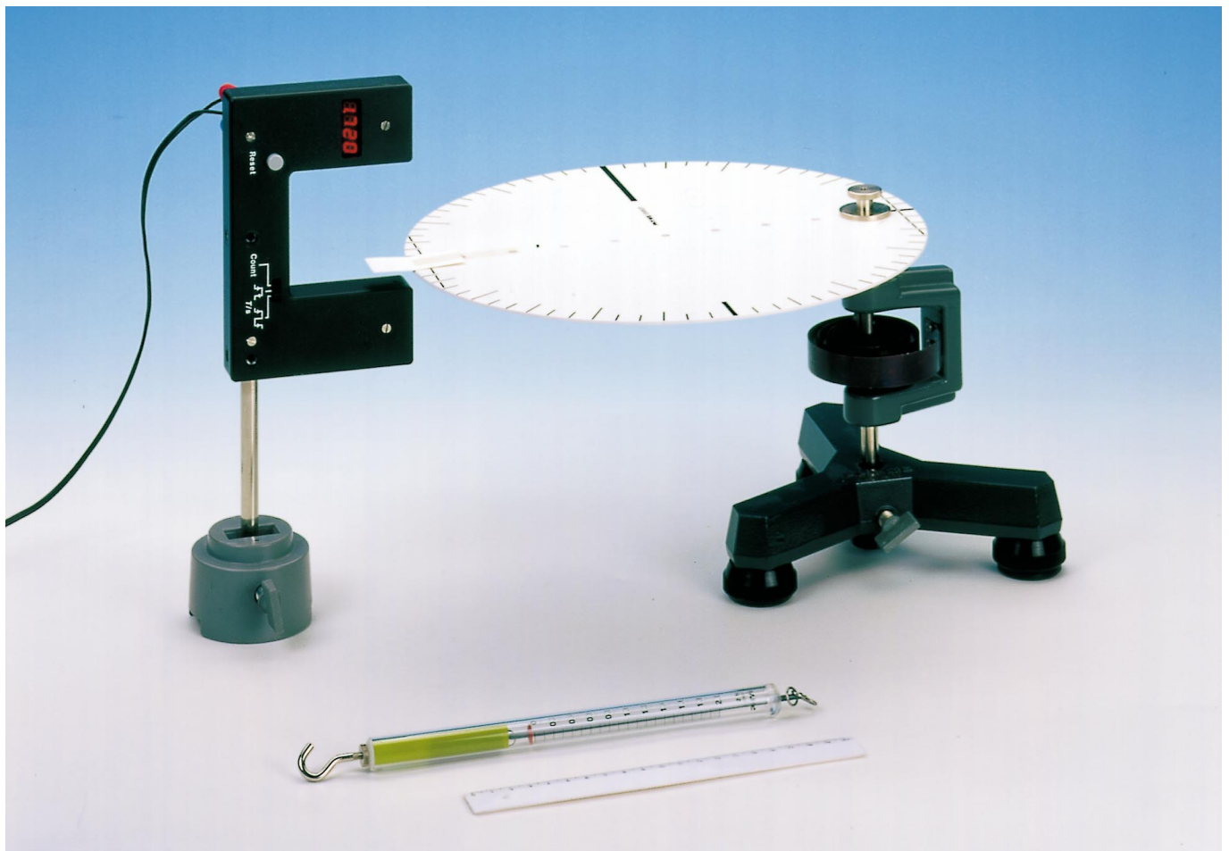
Fig. 1: Experimental set-up for measuring the moment of inertia (Steiner's theorem).