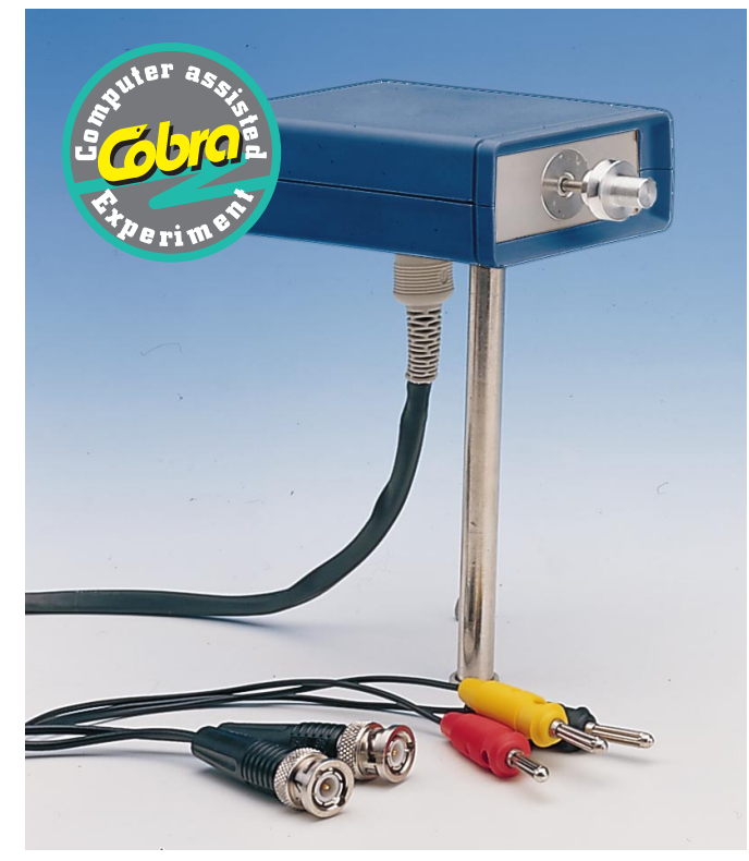
Fig. 1: Movement recorder for the COBRA interface.

in such a way that the rotating axes of the object and of the movement recorder coincide. Coupling is achieved through slight pressure of the blind socket on the rotating axis of the investigated object.